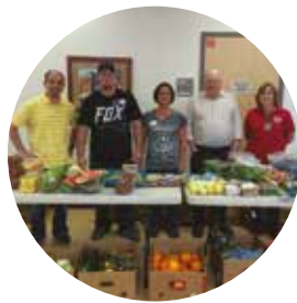
Volunteers get ready to give away fresh fruits and vegetables to families at Jackson Elementary School

In order to reach our goal we have started new distribution sites across the county, targeting sites where families already are, such as local schools. Jackson Elementary and Kids Unlimited Academy schools have participated in the past 2-3 years and each distributed 500 – 1,000 pounds of produce weekly, serving hundreds of families.