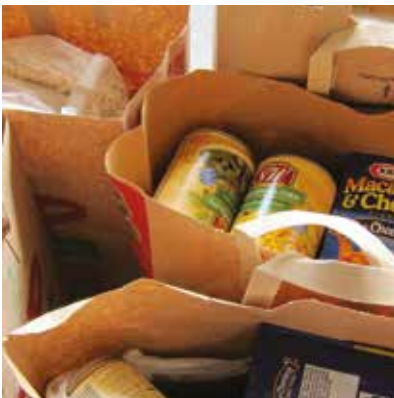
Sherm’s Markets’ Food for Hope food drive puts hunger in the bag

For more information on hosting a food drive, call (541) 774-4321 or email cbosse@accesshelps.org . To make monetary donations, call (541) 774-4312 or visit www.accesshelps.org .