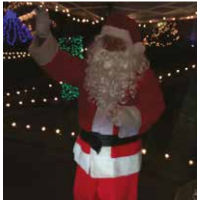
Greystone Court Food Drive brightened up the holidays