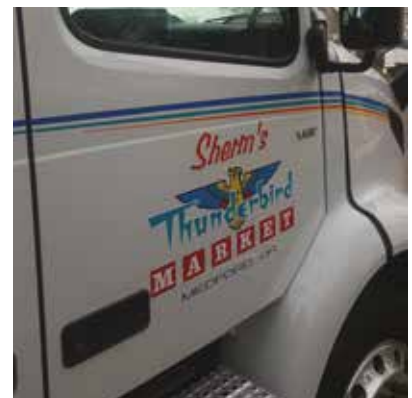
Sherm’s Markets donated 23,000 pounds of food for the hungry