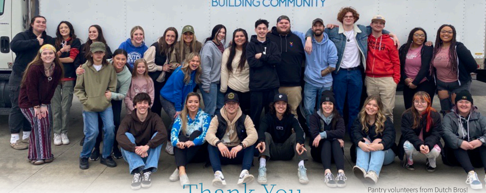
Pantry volunteers from Dutch Bros!