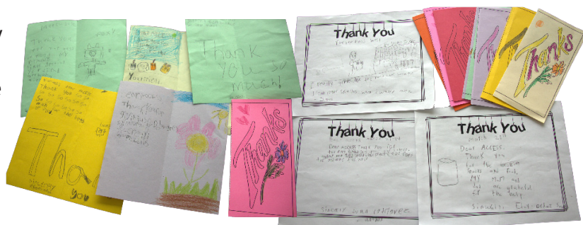
Powerpack students sent us the cutest handmade thank you cards!

If you would like to donate, please visit: accesshelps.org/powerpack