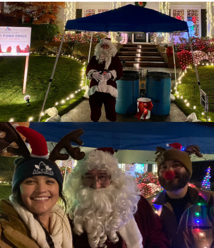
Santa and his helpers