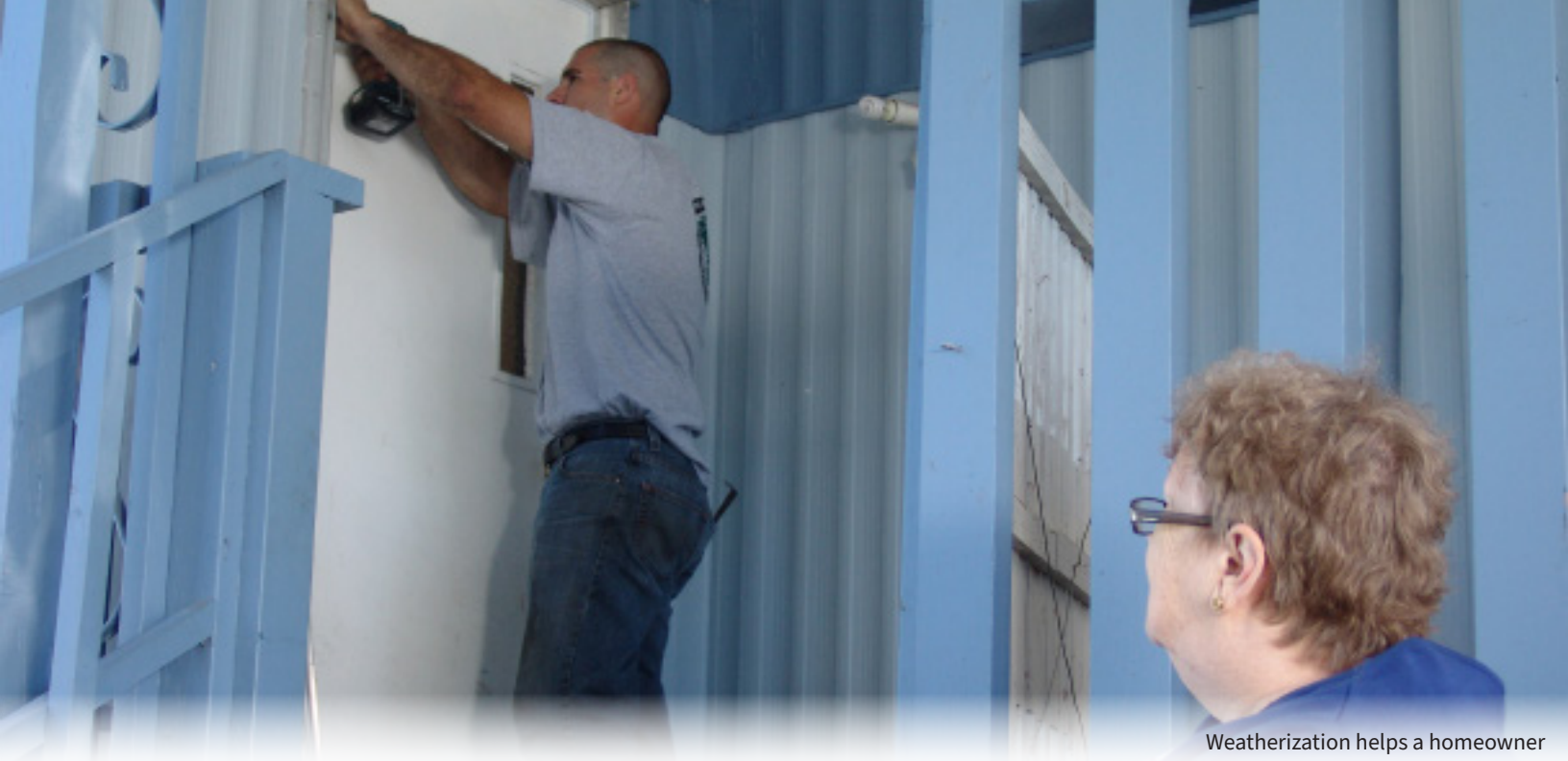
Weatherization helps a homeowner