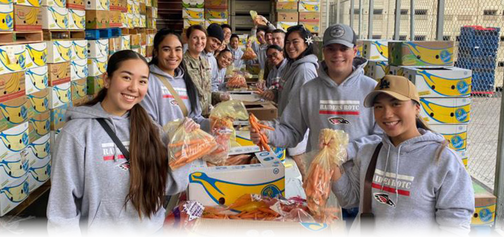
Volunteers from SOU ROTC