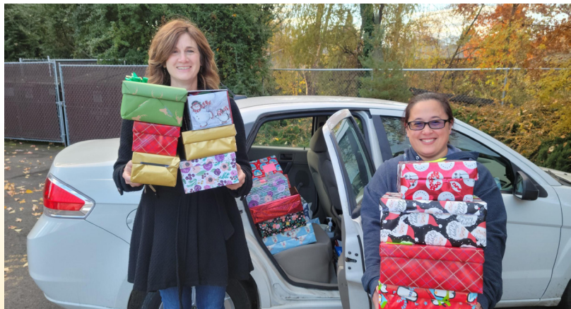
Volunteers spreading joy

Each and every contributor, no matter the level of involvement, was crucial to the success of this decades-long project that brings a sense of connectivity to isolated individuals in our community. From the bottom of our hearts, we thank those of you who contributed to this wonderful project!