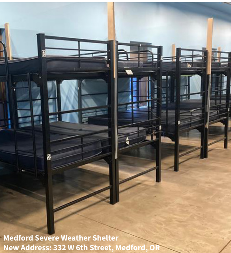
Medford Severe Weather Shelter New Address: 332 W 6th Street, Medford, OR

The Medford Severe Weather Shelter (MSWS) opened up for the winter season in its permanent location at 6th and Ivy St. in downtown Medford. The new location allows our team to serve more people who are experiencing homelessness in a safer environment. The shelter opens from 5:30 pm to 8:30 am when temperatures drop to unsafe conditions as determined by the City of Medford. The shelter serves an average of 60 people a night with clean beds, a warm place to rest, and a warm meal, as well. The MSWS, operated in partnership with the City of Medford, is instrumental in saving the lives of unhoused individuals. If you or someone you know needs help, call (541) 779-6691 or visit accesshelps.org/medford-severe-weather-shelter/