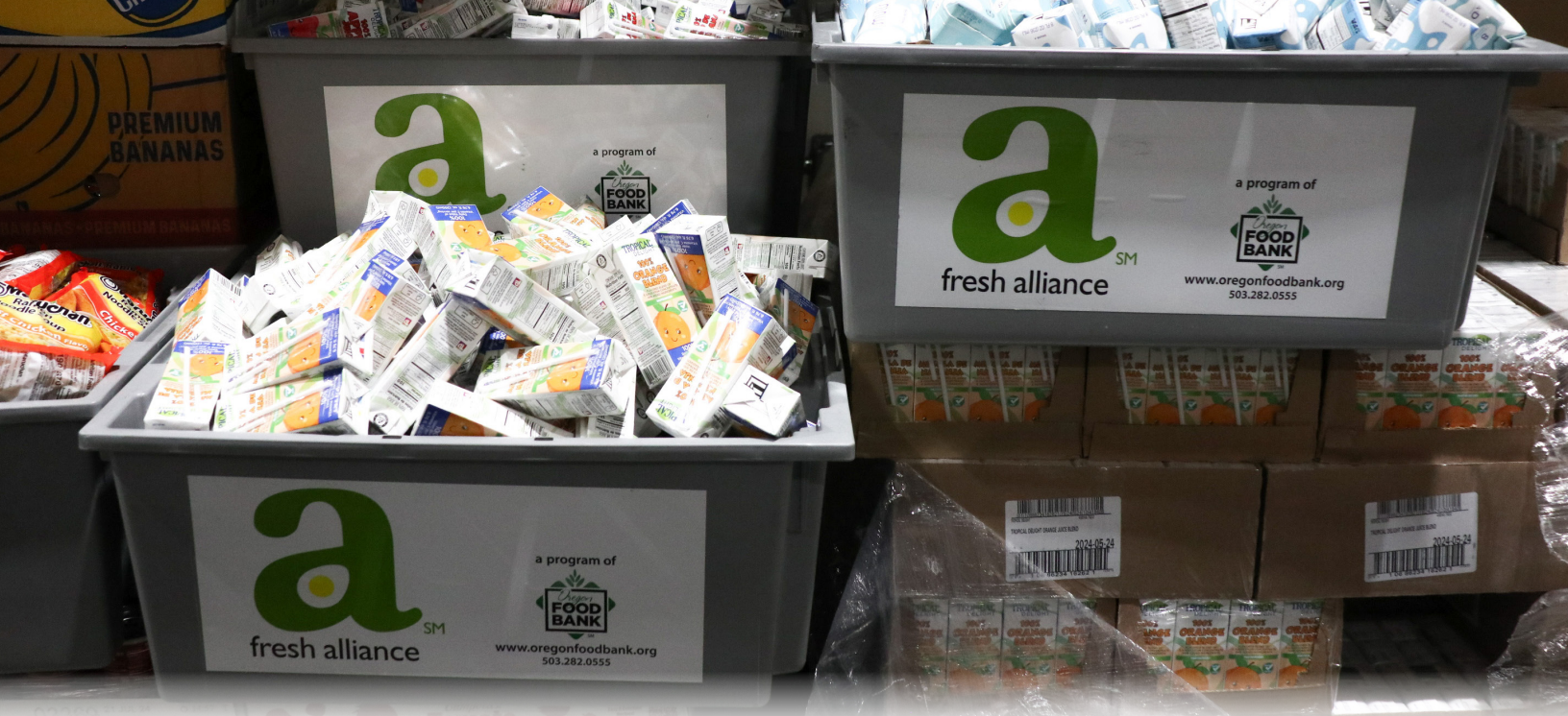
Fresh Alliance bins full of items for participants