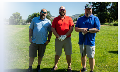
Boise Cascade team